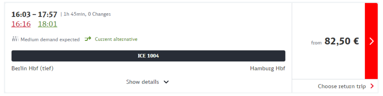
Figure 2: Screenshot of the Deutsche Bahn (bahn.de) web timetable with an occupancy forecast, displayed with three manikins and a text ("Medium demand expected").

The German main railway operator Deutsche Bahn introduced similar forecasts in 2019 (Figure 2). They do not distinguish between first and second class.